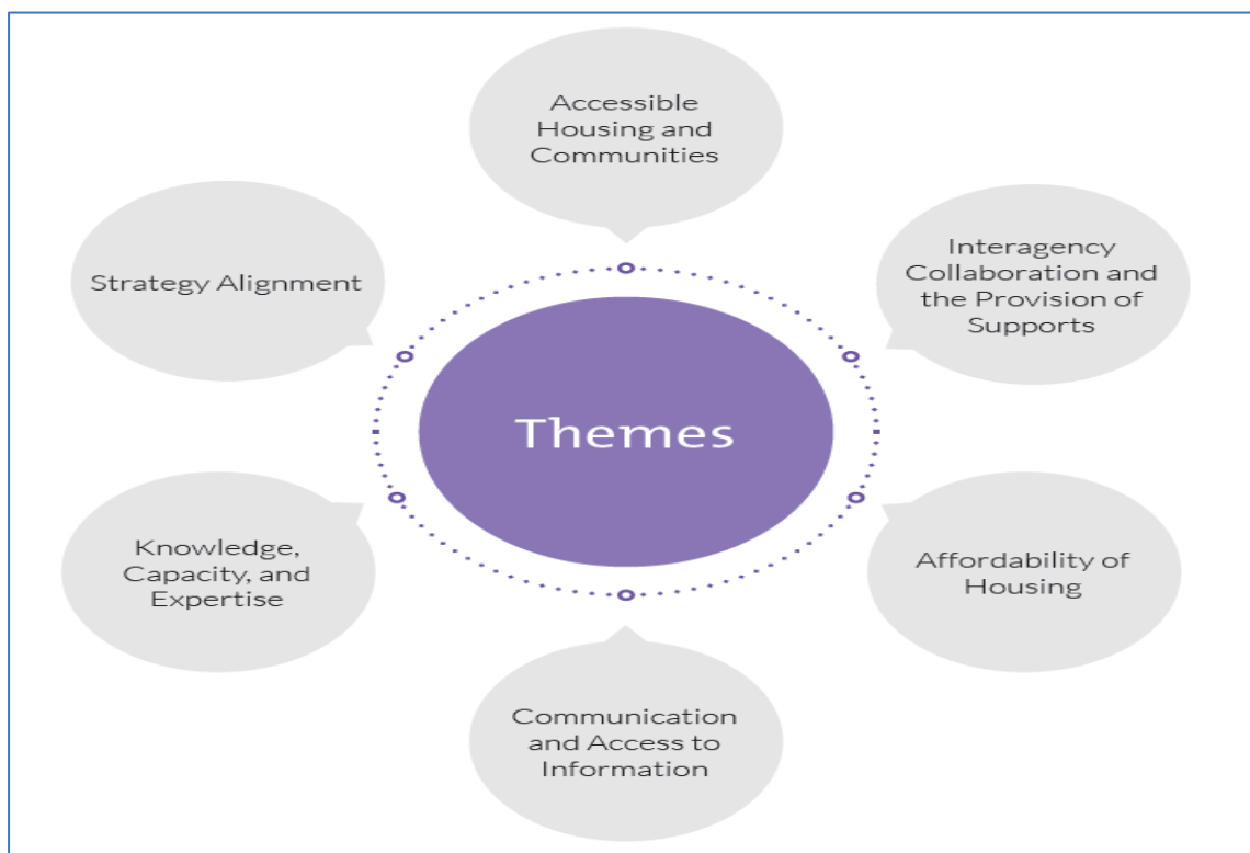
Fig.1 Themes identified under the National housing Strategy for Disabled People.

HDSG and members referenced in 64 Actions in the National Implementation Plan.