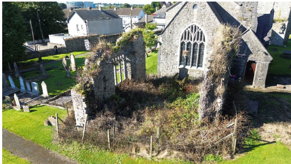
Medieval chancel of St. Patrick's Church, Trim

2. St. Patrick's Cathedral, Trim: A Conservation Management Plan with input from conservation architect, structural engineer and archaeologist was completed and submitted to the National Monuments Service. This project was funded by the Community Monuments Fund 2024. The plan sets out a conservation strategy that will enable the church and its environs to continue to be a place to visit and celebrate its heritage significance into the future.