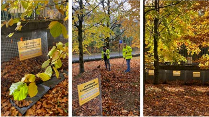
(Johnstown Tidy Towns)