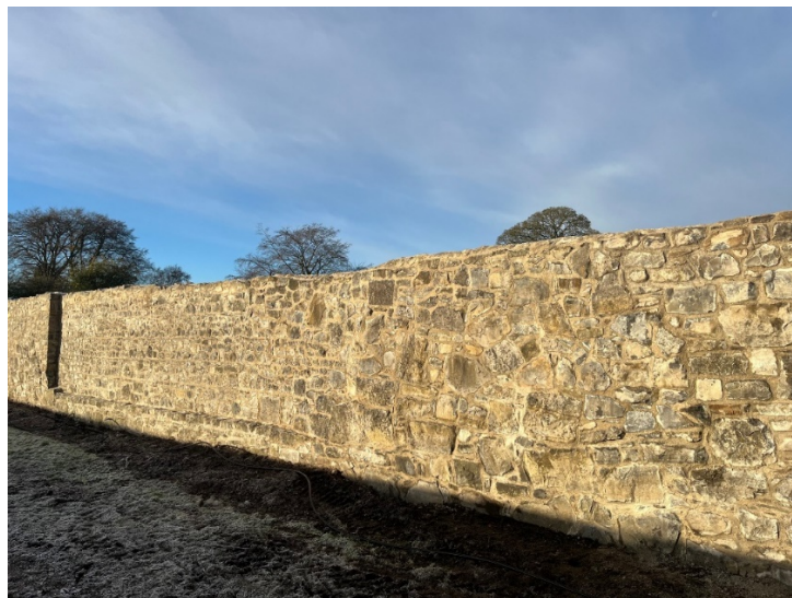
Completed conservation works at Trim Town Walls

works which were monitored and recorded by the Conservation Team. Works were funded by the Heritage Council Irish Walled Town Network Conservation/Capital Fund 2024 and Meath County Council.