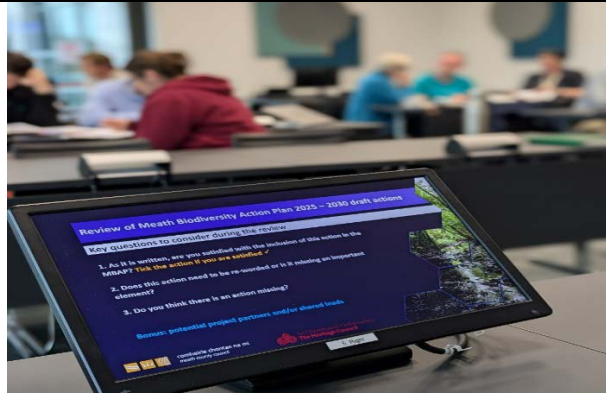
Biodiversity Working Group meeting – 1 st November 2024.