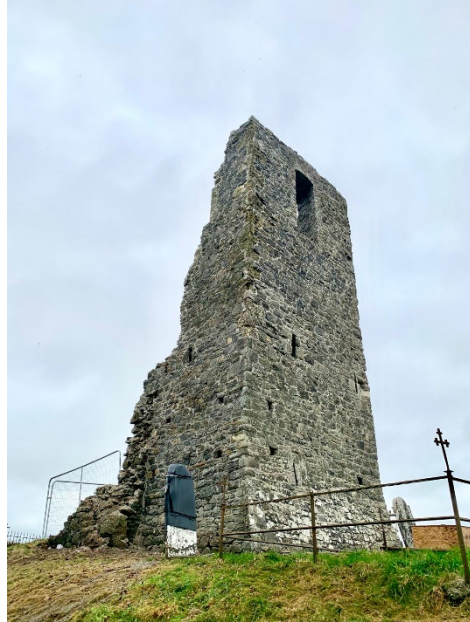
Completed conservation works, Ardulchan Church

2. St. Patrick's Cathedral, Trim: A Conservation Management Plan with input from conservation architect, structural engineer and archaeologist was completed and submitted to the National Monuments Service. This project was funded by the Community Monuments Fund 2024. The plan sets out a conservation strategy that will enable the church and its environs to continue to be a place to visit and celebrate its heritage significance into the future.