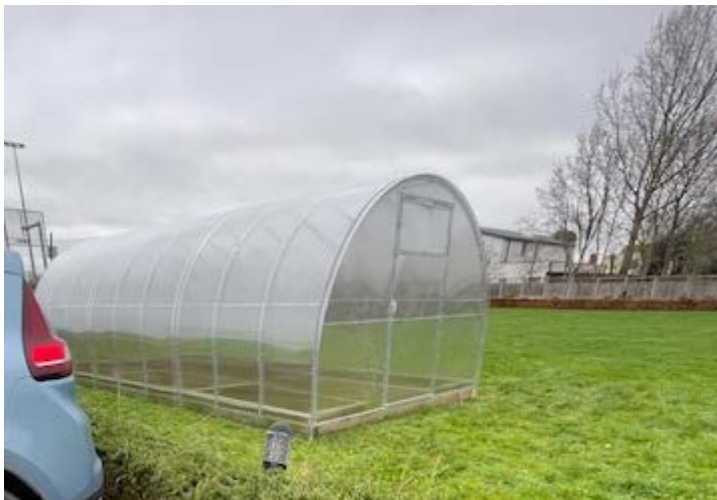
(Polytunnel at Mercy Secondary School for food production)

The gardens allow the schools to provide hands-on training to young people, allowing them to understand nature, biodiversity, soil and water management, food production etc.