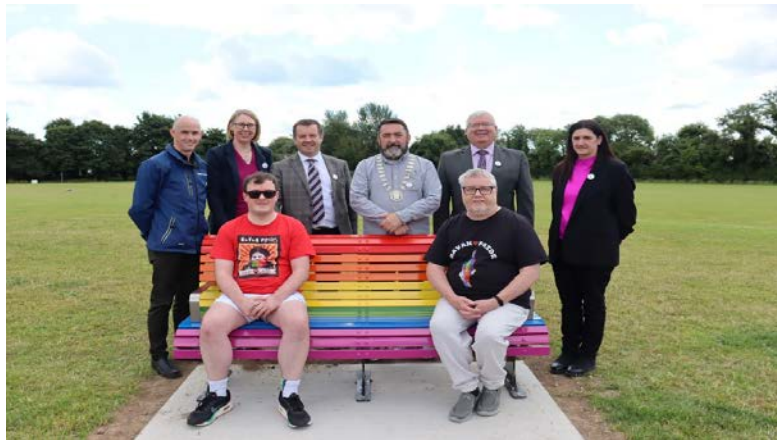
Mayor of Navan Cllr. Eddie Fennessy at the unveiling of the Rainbow Bench in Blackwater Park to mark the beginning of Navan Pride Festival