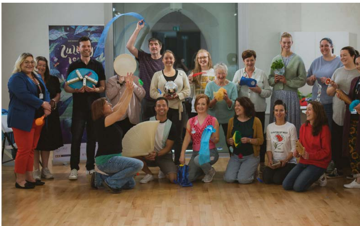
Artists and educators from County Meath attending Lullaby Leaf CPD at Trim Library and Swift Cultural Centre.