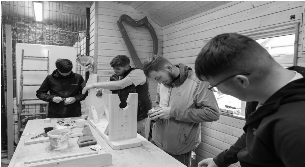
Young Traveller men working on one of the benches for the St. Brigid's Grotto in the Michael McDonagh Training Hub on the grounds of Meath Travellers Workshop.