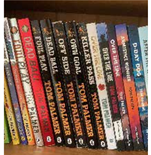
Suitable for 2nd/3rd Classes