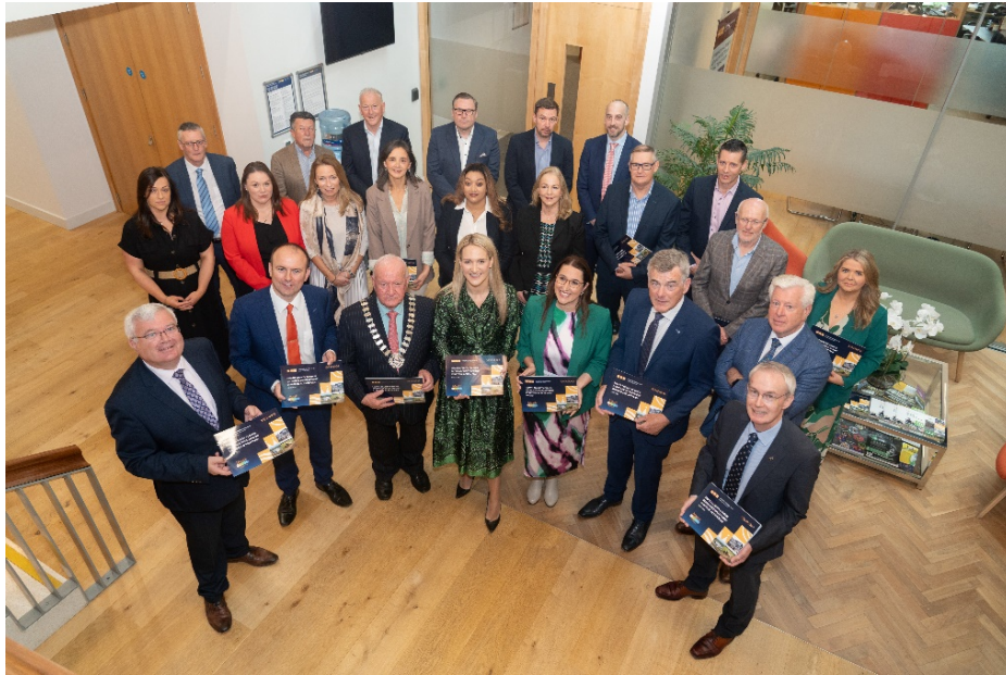
Fig 4: Photo from the launch of the Meath Economic Development Strategic Action Plan with Ministers McEntee and Higgins and the Meath Economic Development Forum Members