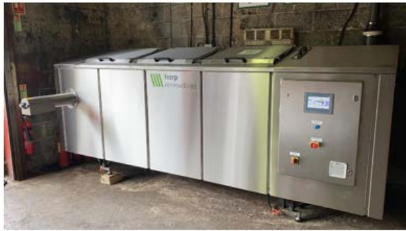
Food Waste Digester – Navan Recycling Centre

The Climate Action Section recently gave a public demonstration of how the food waste digester located within Navan Recycling Centre at Mullaghboy Navan works. Food caddies were handed out on the day.