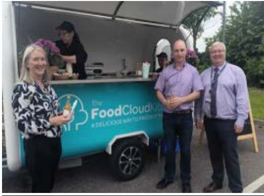
Too Good To Waste

The Climate Action Section recently held the Too Good to Waste Lunch and Learn with MCC employees in Buvinda to raise awareness around food waste, the emissions and effects associated from food waste in landfill and to promote sustainable eating habits to reduce food waste.