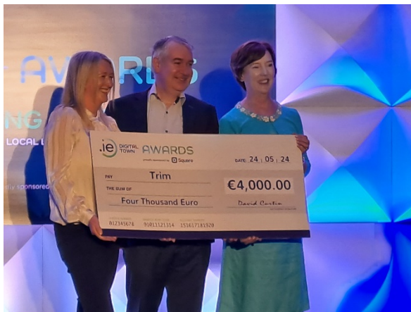
TRIM AIR QUALITY PROJECT

The Trim Air Quality Monitoring project from Meath County Council was shortlisted and won the award for Digital Sustainability for its work monitoring the levels of air pollutants in Trim. The Digital Town Awards promote awareness, knowledge, use and understanding of digital technologies in Ireland by its citizens, businesses and communities. They also highlight the benefits and possibilities of digital and celebrates the digital achievements of towns across Ireland.