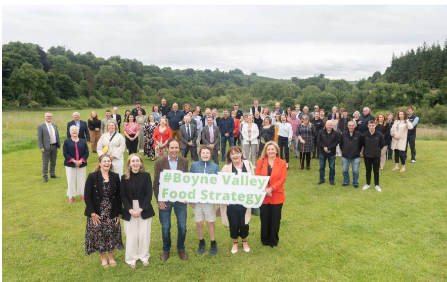
Photo from the Boyne Valley Food Development Strategy launch which took place at Slane Castle on 18th June

It sets out the priorities for the region for the next 5 years, with an overall vision for the Boyne Valley to be recognised for its collaborative approach to developing food as a sustainable economic sector and a food destination where our producers are at the heart of our food culture. Read the full strategy here: https://bit.ly/3VL04qy