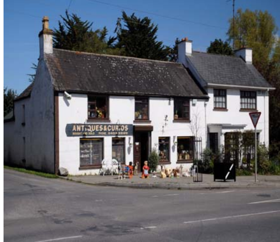
The village has a mixture modern and traditional development