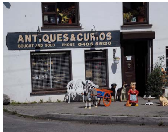
Business Premises in Longwood