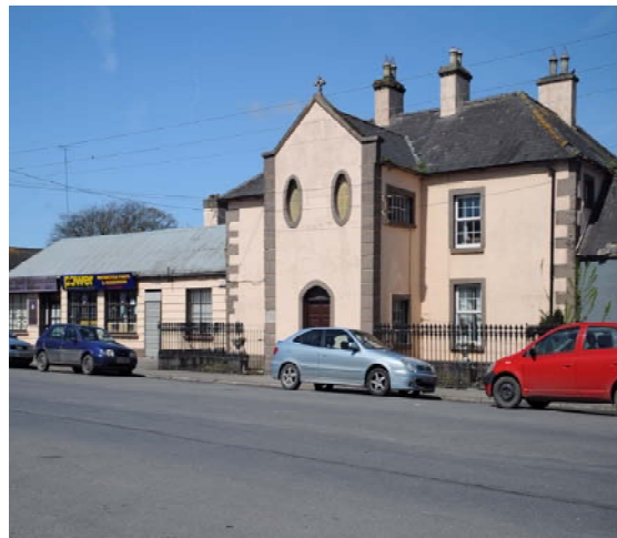
Buildings listed on the Record of Protected Structures in Longwood