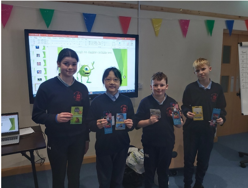
Tráth na gCeist – Winners - Gilson N.S. Oldcastle