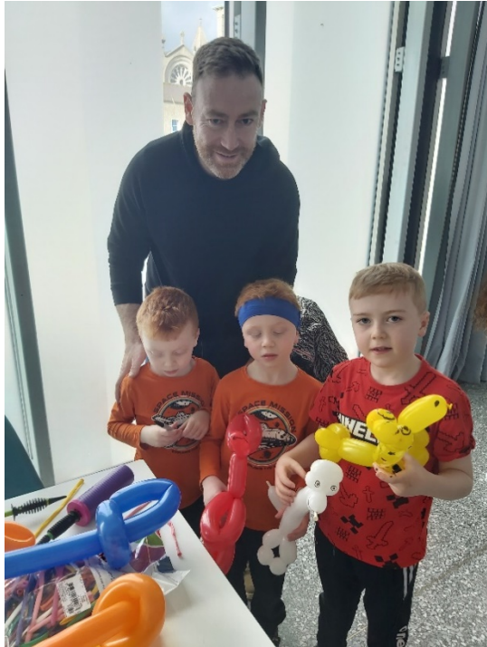
Balloon making - Solstice Theatre – 2/3/2024

is always a great opportunity for the Irish Language Office to give support to the primary schools to promote Irish amongst the children.