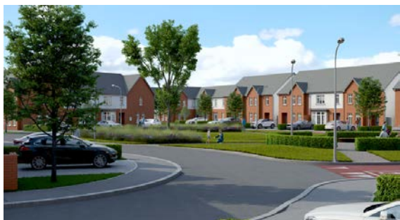
Photo 4: Affordable Purchase - Baker Hall, Navan

Successful applicants are at various stages of the conveyancing process.