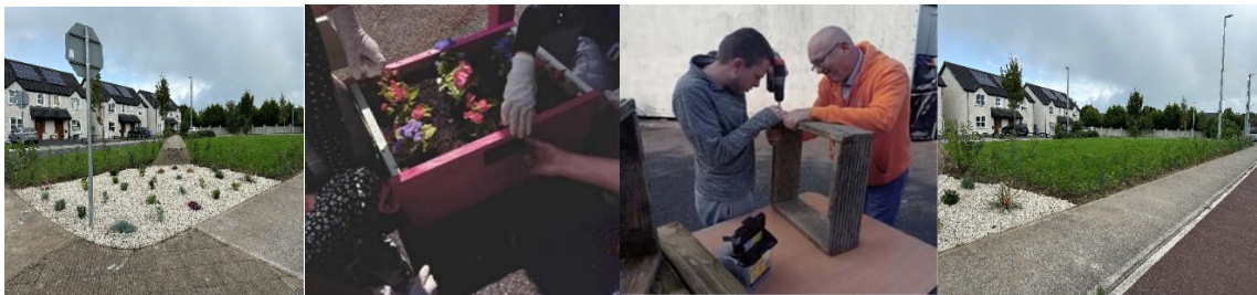
Photo 6: Connaught Grove Athboy – Examples of Estate Management Funding

In 2023 we supported an initiative with Youth Work Ireland Meath and The Men's Shed Navan . They built flower beds, cut grass for older people, general clean up in council estates in the Navan Area. 50 individual young people took part in this initiative over the summer months. The young people created a video of the works they completed. A presentation by the Cathaoirleach and Mayor of Navan took place in Buvinda House on the 2nd of November 2023 to acknowledge their hard work.