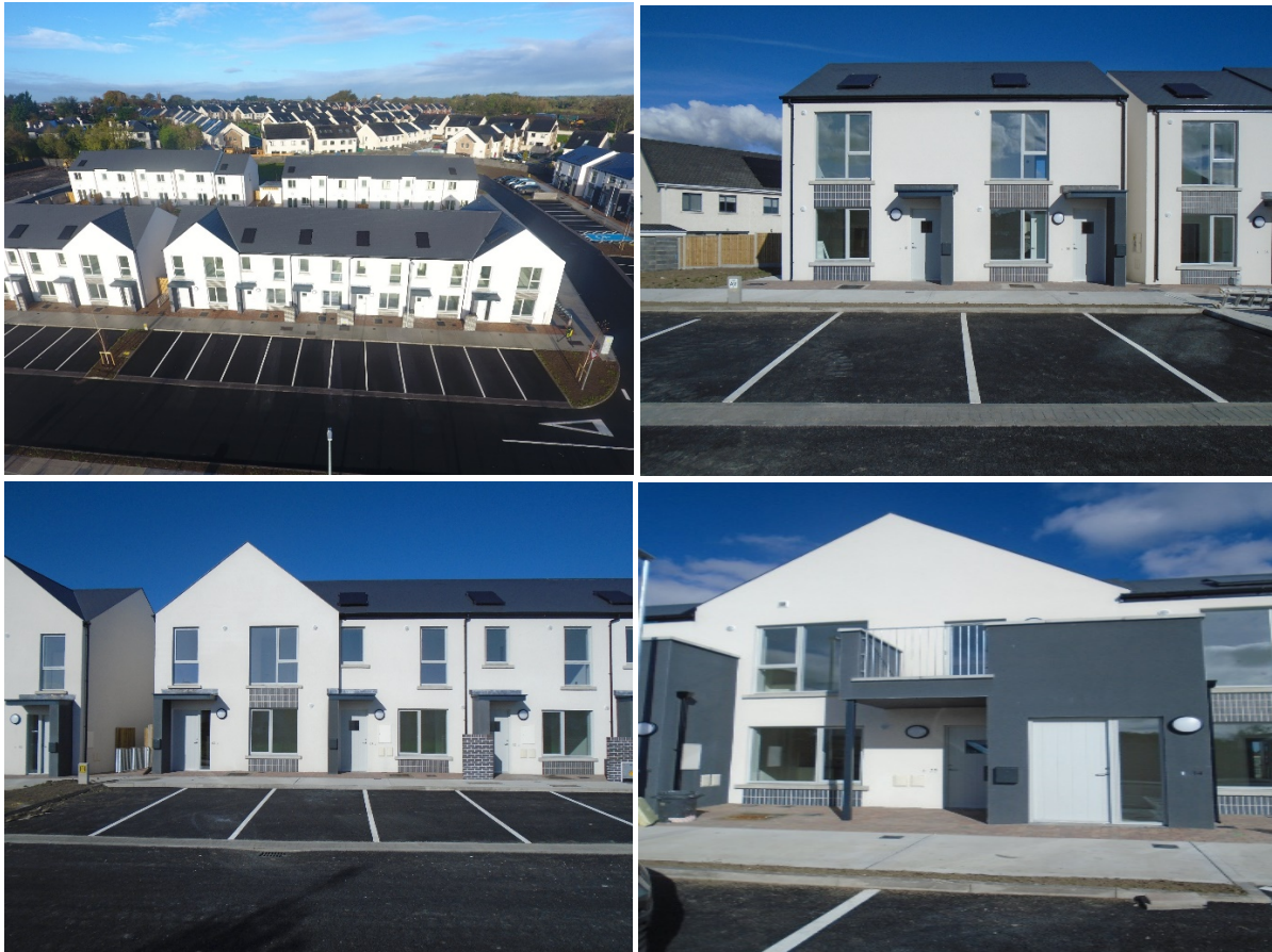
Photo 1 & 2: Meath County Council Site Direct construction – Lagore Lawn, Dunshaughlin