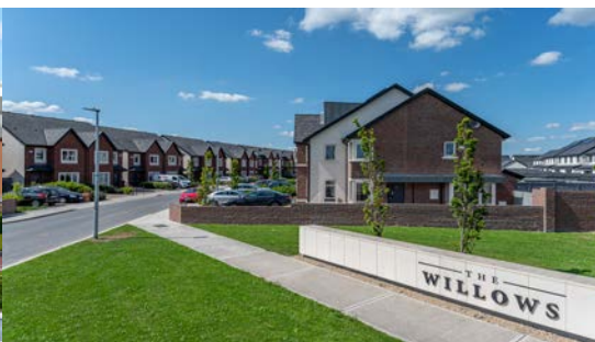
Photo 5: Affordable Purchase – The Willows, Dunshaughlin