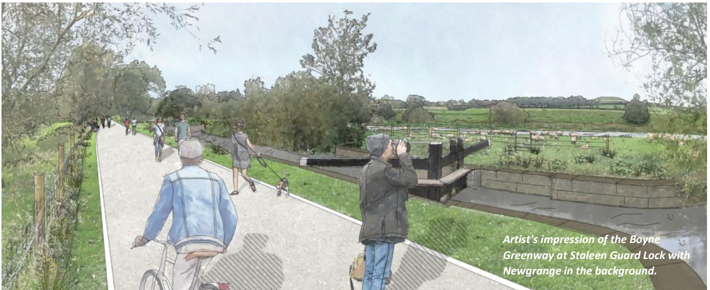
Artist's impression of the Boyne Greenway at Staleen Guard Lock with Newgrange in the background.