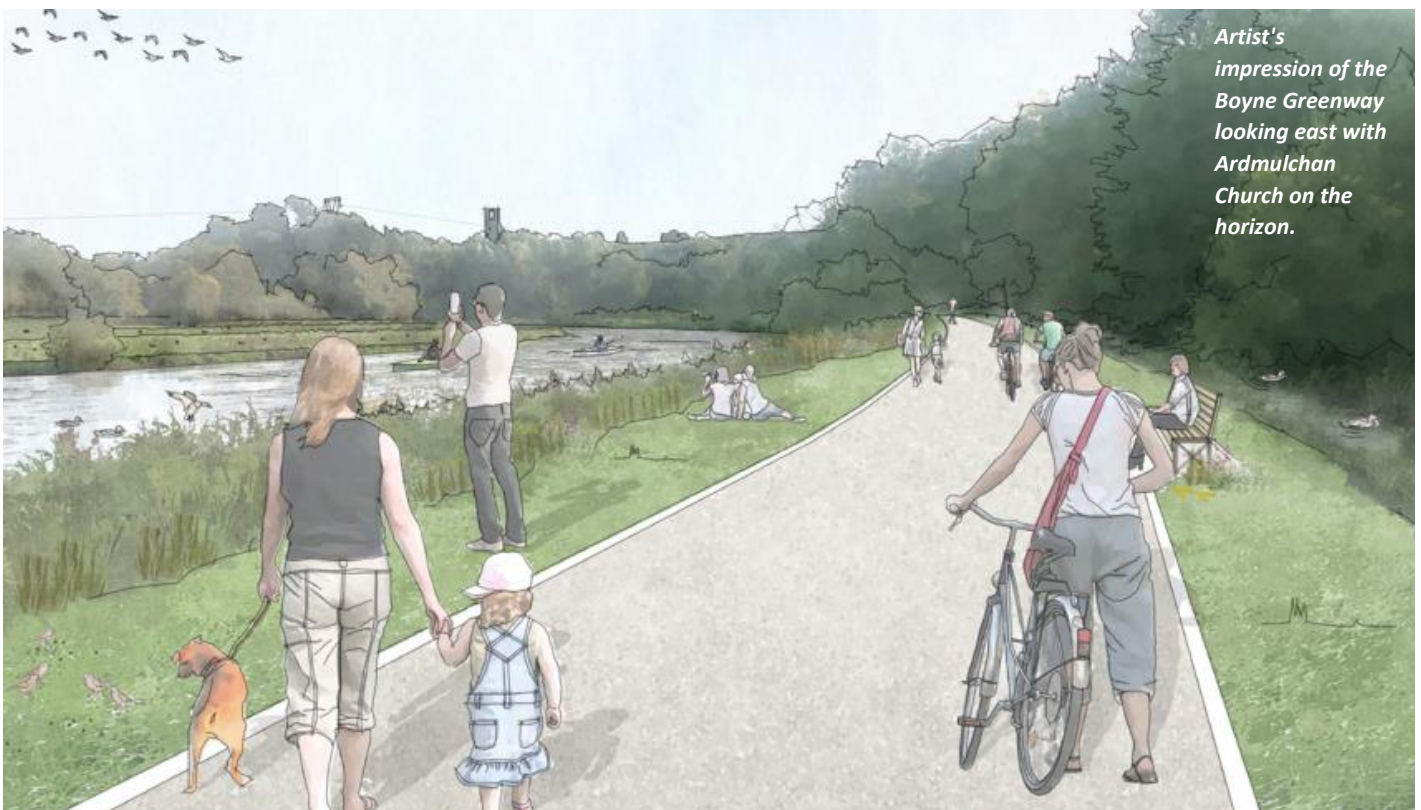
Artist's impression of the Boyne Greenway looking east with Ardmulchan Church on the horizon.