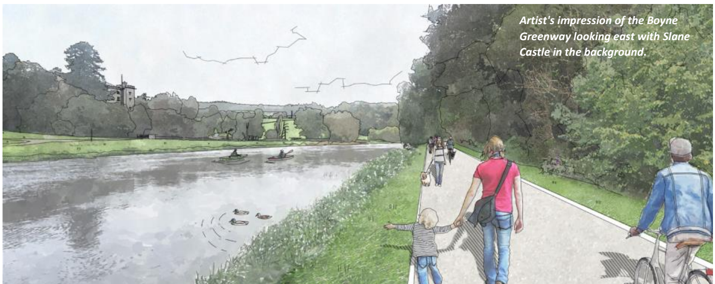
Artist's impression of the Boyne Greenway looking east with Slane Castle in the background.

Key Dates: Public Consultation Display Period will run from the 11th December 2023 to the 29th January 2024 with Submissions accepted up to 5:00pm on the 9th February 2024.