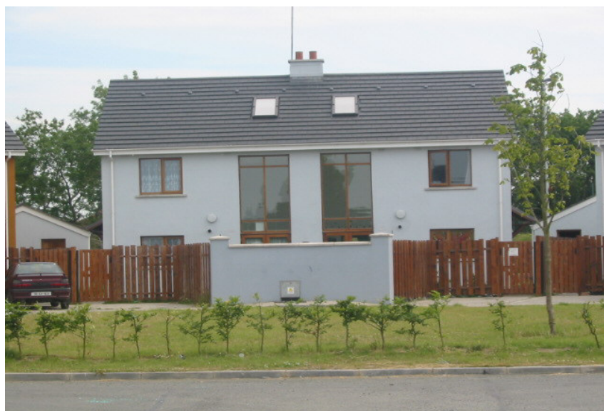
Social & Affordable Housing, Windtown

Up until recent times the land use pattern in Navan and its environs was characterised by a very low percentage of residential uses within the town centre and expanding residential developments of relatively low density conventional housing developments on the outer fringes of Navan. These low density conventional housing developments are primarily concentrated to the south east of the town in Johnstown, Bailis & Athlumney, to the south of the town at Balreask Old and Limekilnhill and to the north of the town at Blackcastle Demesne, Abbeylands & Clonmagadden. However, in recent years a number of new developments have been constructed in the town centre and at neighbourhood centre locations which provide for higher density development thereby resulting in a more efficient/economic use of valuable land, in accordance with the government policies prescribed in the ‘Sustainable Residential Development in Urban Areas’ Guidelines for Planning Authorities.