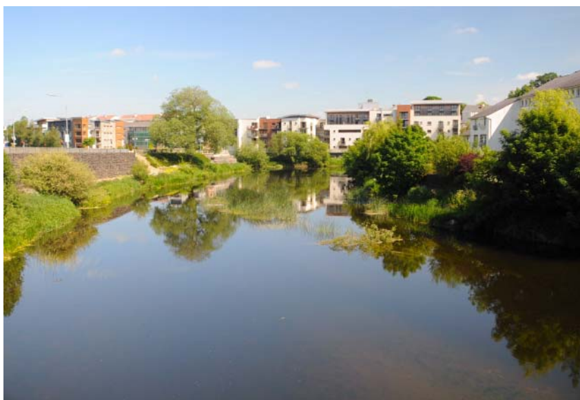
Apartments on the Waterfront

The scale of residential development is predominately two storey semi detached and detached structures. However, development at edge of town centre and riverside locations as well as at neighbourhood centres has introduced higher scale developments and includes a mix of residential units, including apartments and duplexes.