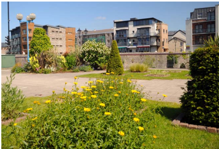
Contemporary Residential Design

Community: Meeting people's needs, desires and aspirations, and engendering civic pride. A proactive, holistic approach to planning is thereby encouraged whilst a reactive, piecemeal approach to planning and a compromised result is actively discouraged.