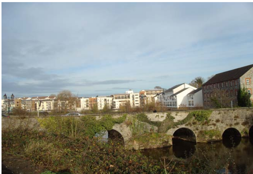
Riverside Residential Development

The successful design of a good quality sustainable housing project depends on the balance struck between a range of factors as detailed below: