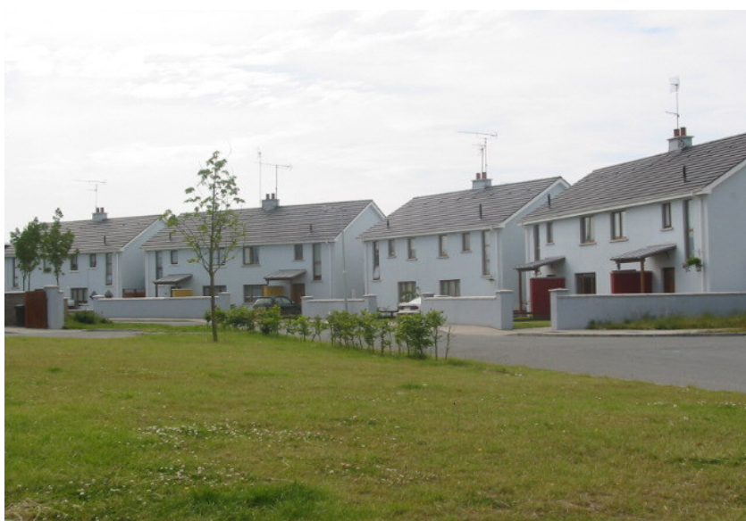
Social & Affordable Housing, Windtown

Social housing is concentrated in certain sectors of Navan, primarily on the Windtown Road and the Commons Road areas of Navan. The larger concentrations of social housing have led to a social imbalance in their respective areas of the town. In order to redress this imbalance, Meath County Council and Navan Town Council intend to restrict, any significant, additional social housing in these areas. So as to avoid an undue concentration of social housing in any particular area it is intended that the planning authorities may seek up to 20% affordable housing in lieu of the maximum 10% social and 10% affordable housing requirement, which will be sought elsewhere in Navan. Furthermore, where demand for affordable housing so indicates, the Council may require applicants/developers pay a financial contribution, or other arrangement provided for under the Planning & Development (Amendment) Act 2002, in lieu of the full 20% affordable housing on site. This provision may apply to the lands zoned primarily for residential purposes at the following locations: between the proposed Local Distributor Road Link connecting the Commons Road and the Trim Road, between the Commons Lane and the Commons Road, and identified lands west of the Navan Town Park.