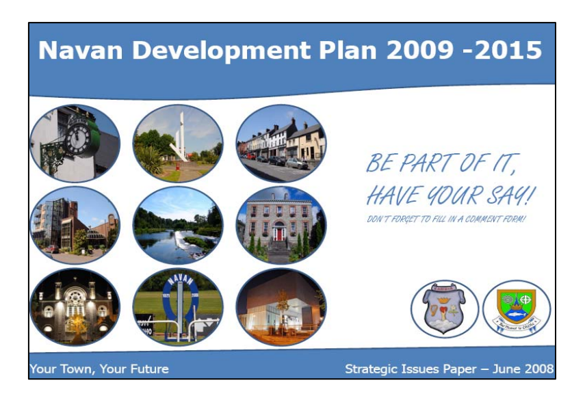
Booklet which was distributed during the public consultation meetings

The submissions and comments received during the pre-draft consultation phase were summarised and addressed in the Pre-Draft Manager's Report which was presented to the elected members of Navan Town Council and Meath County Council on July 16th 2008.